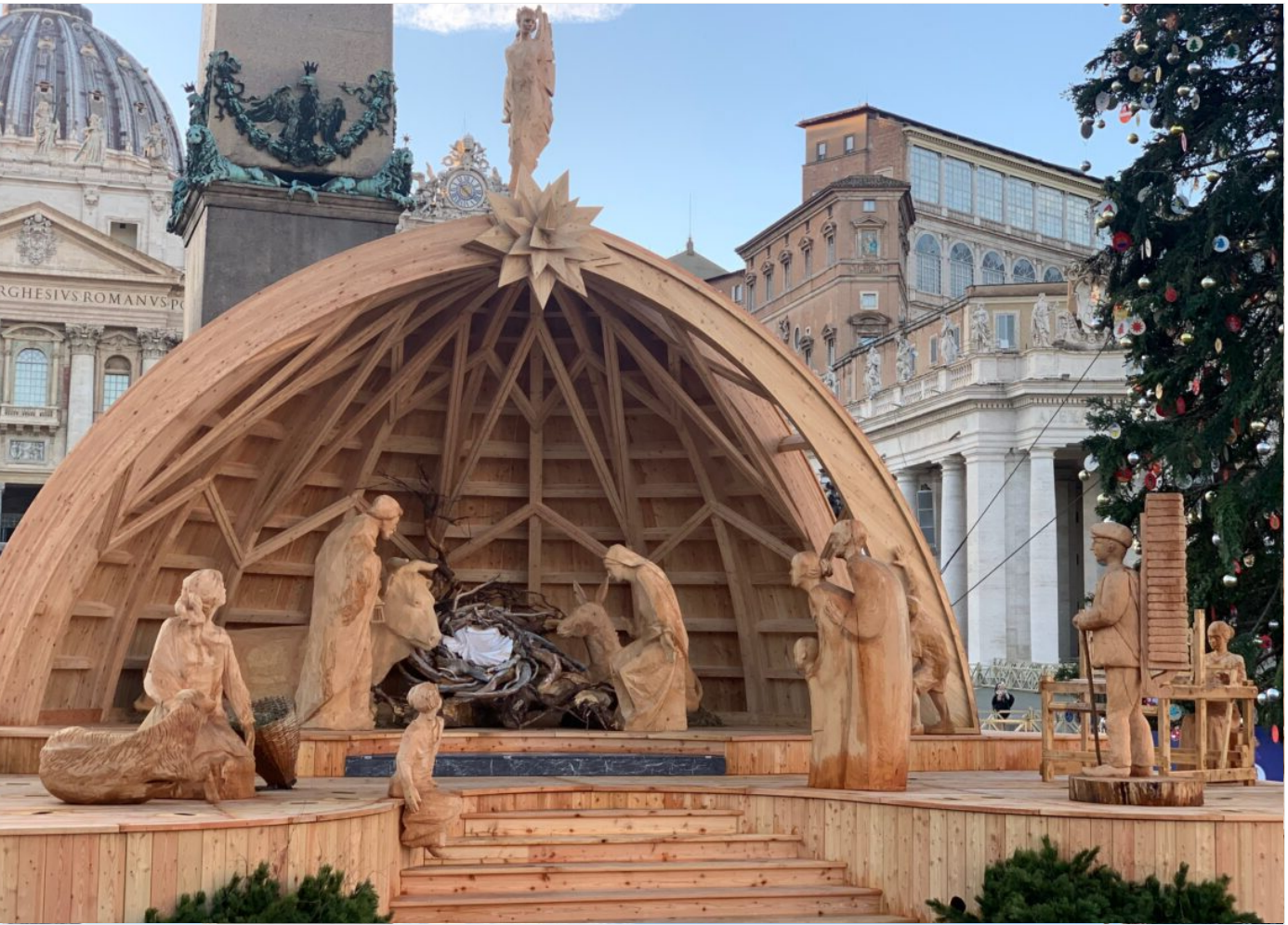
Center of 2022 crèche in St. Peter's Square