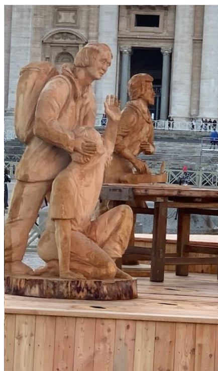
Solidarity with the marangon or carpenter in the background

The majestic 30-meter white fir tree comes from the tiny mountain village of Rosello, home to some 180 inhabitants, in the Abruzzi, very near the border with Molise, located at nearly 1000 meters above sea level on the slope of a cliff overlooking the entire Valley of the River Sangro. According to tradition, Rosello owes its medieval origin to the Benedictine monks of the Abbey of San Giovanni in Verde.