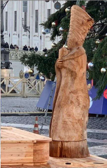
Melchior, one of the Three Kings