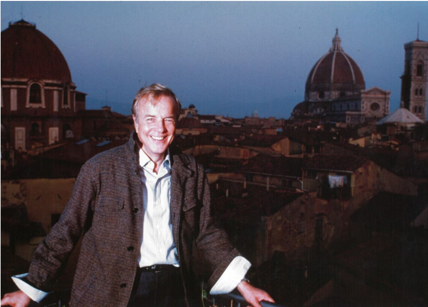
Franco Zeffirelli in Florence.