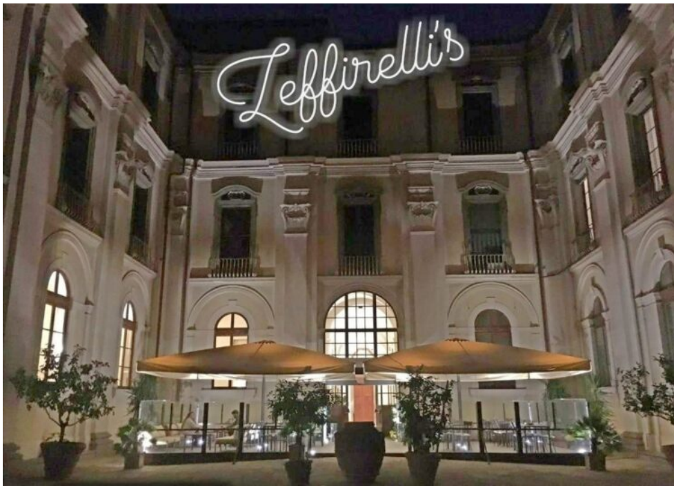
Zeffirelli's Bar, Tea Room and Restaurant