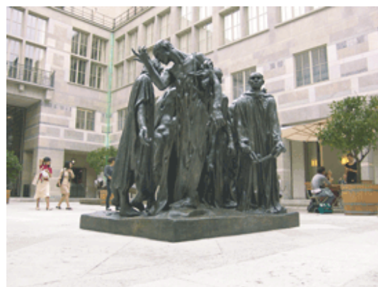
Courtyard of the Kunstmuseum

Directly across from the Kunstmuseum Basel on the main downtown street, St. Alban-