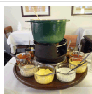
Fondue Bacchus

elegant suburb of Bruderholz overlooking Basel, another must is the Fondue Bacchus at the centrally-located Safran Zunft , housed in the spice traders' guildhall. Yet another is elegant Chez Donati with its beautiful view over the Rhine and