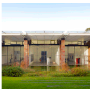
Beyeler Foundation museum