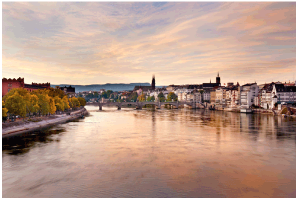
Basel on the Rhine