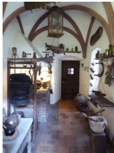
The Pharmacy Museum, Basel, photo ©2012 by Lucy Gordan

birthplace of Zionism. The first Zionist Congress, convened and chaired by Theodor Herzl, was held here from August 29-31, 1897. The museum, which aims to introduce visitors to Jewish customs and ceremonies, exhibits valuable items depicting religious and everyday life. These include tombstones, medieval documents, Hebrew books printed by the famous Basel typographers, and mementos from Zionist Congresses. Another fascinating museum, formerly a convent church, is the Historical Museum of Basel which spotlights the city's role as the crossroads between the three local cultures: Swiss, German and French. Its highlights include numerous Pre-Reformation sacred artifacts, in particular the Basler Totentanz (Dance of Death) and the Basel Cathedral Treasury.