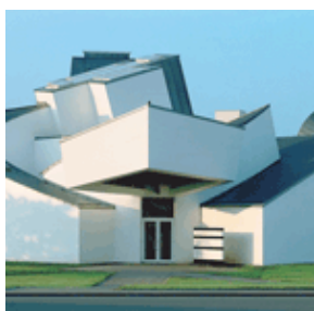
The Frank Gehry designed Vitra Design Museum

Graben, is the Antikenmuseum Basel und Sammlung Ludwig housed in several “protected” small landmark 19th-century houses. Founded in 1961 and opened in 1967, thanks to the support of many local scholars, businessmen, and collectors, and then enlarged in 1981 because of the generosity of German chocolate magnate and voracious art collector Peter Ludwig and his wife Irene, it’s the only Swiss museum devoted exclusively to the ancient civilizations of the Mediterranean region, particularly Greece, with artifacts from the 4th millennium BC to the 7th century AD, most dating from 1000 BC to 300 AD.